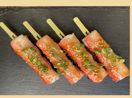
Crab stick skewers