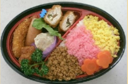
Three Color Bento