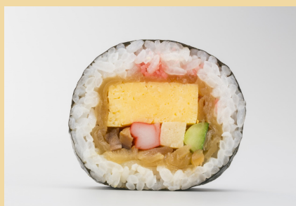
Traditional Sushi Roll