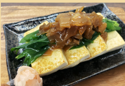
Appetizer with Tofu