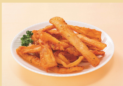
Fried Kanpyo Chips