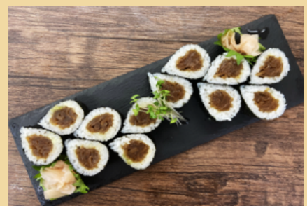
Tears Roll with Wasabi