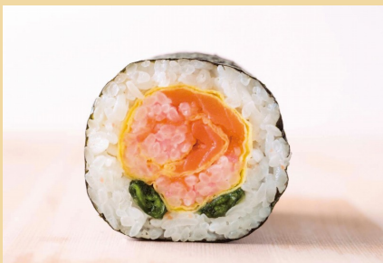
Rose Blossom Sushi Roll

It can be used as a substitute for seaweed, adding a touch of color to your menu.