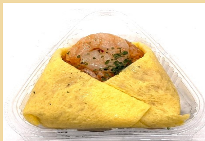
Omelette Rice Ball