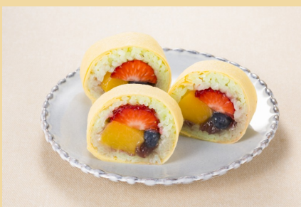
Sushi Roll-style Sweets