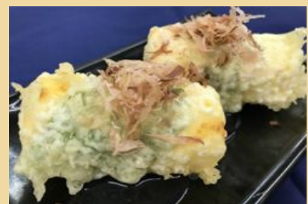
Dashi Egg Tempura