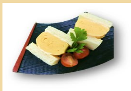
Dashi Egg Sand