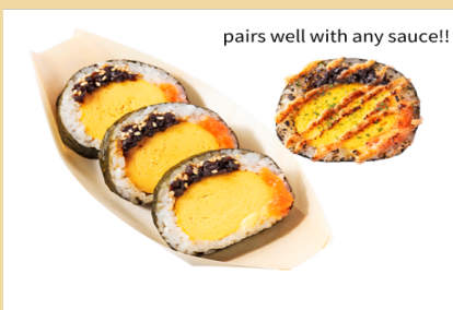
Dashimaki Roll Sushi