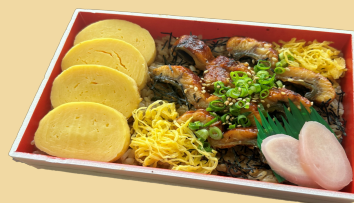
For bento box